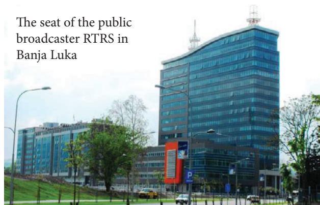
The seat of the public broadcaster RTRS in Banja Luka

In October 2013, the RS National Assembly legalized the elimination of the CRA during the appointing of members of the RTRS Board of Directors and legalized the financing of missing funds from the RS budget. With these two interventions RTRS was formally out under the control of governing majority and the principles of the Law on Public RTV System were thus derogated. One more amendment reinforcing the RS National Assembly to dismiss the members of Board of Directors if they do not act as instructed is in process. At the same time, CRA allowed RTRS to establish another channel marked as the "additional program service" which leads to a complete emancipation from the public RTV system in BiH.