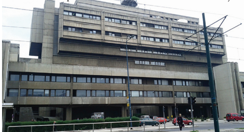
The seat of the public broadcasters BHT1 and FTV in Sarajevo

Public broadcasting services in BiH have been stretched between international community, political leaders, ethnic audience, divided journalism viewers and listeners and economy powerful figures and they have been patting intact for more than 15 years. This seems reasonably short period on one hand, but on the other hand, it does appear pretty long in terms of fast technological conditions emerging, including legislative changes in EU that they tend to meet and fulfill. Unique public broadcasting service in Bosnia and Herzegovina at present is not possible and will not be possible until the moment of crucial political changes occur in terms of full integration of society based on democratic principles and exclusively based of civil orientations. Strategies or abolitions or even dissolutions of public broadcasting services shall lead to the same end: regression of a transitional process towards modern democratic systems and finally the division of social community 8 . And citizens must not allow this, if they can have say in this anyway.